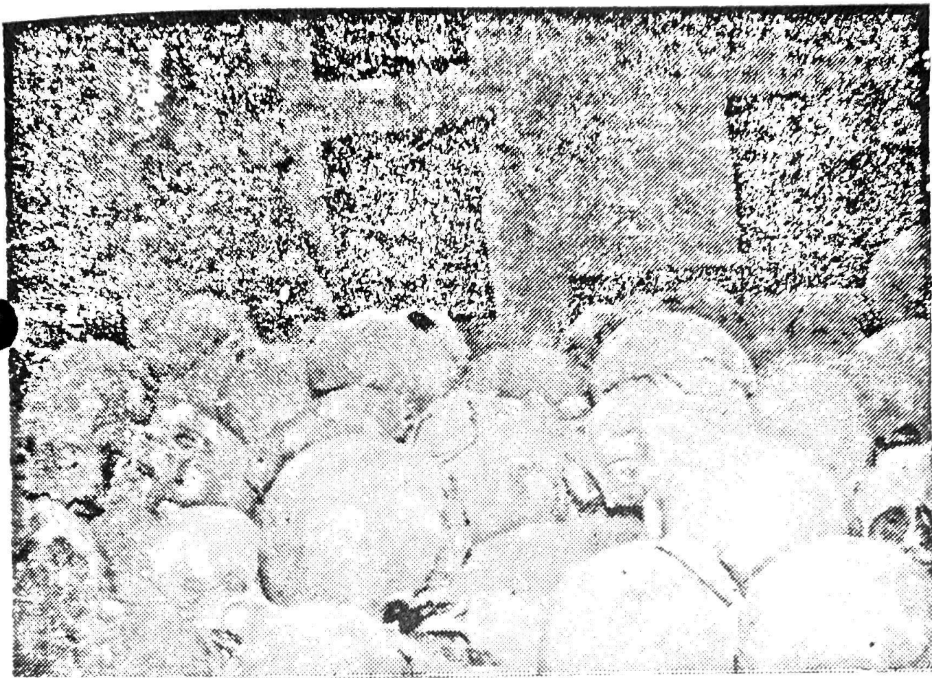
Skulls of three thousand in Mt. Sinai Cave.

unto Aaron, and said unto him: 'Up, make us gods which shall go before us, for as for this Moses, the man that brought us up out of the land of Egypt, we wot not what has become of him.' Aaron said unto them. 'Break off the golden earrings which are in the ears of your wives, of your sons and your daughters and bring them unto me.' The molten calf was made from this gold. Then the people said: 'These be the gods of Israel that brought us out of the land of Egypt.' Then it says the people rose up early in the morning, offered burnt